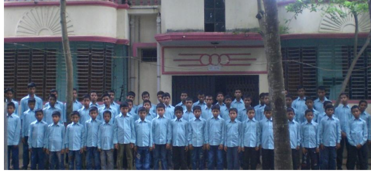
Students at our facility in Sirajganj, Bangladesh